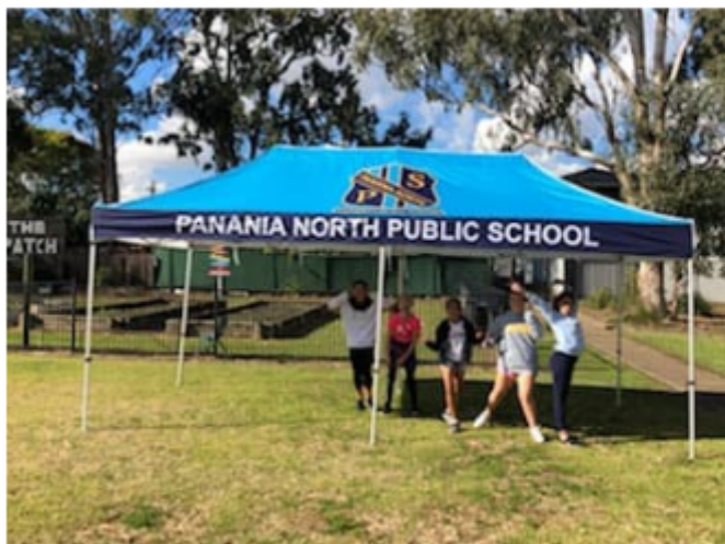
New PNPS marquee

Donated to the school from our lovely 2018 year 6 students